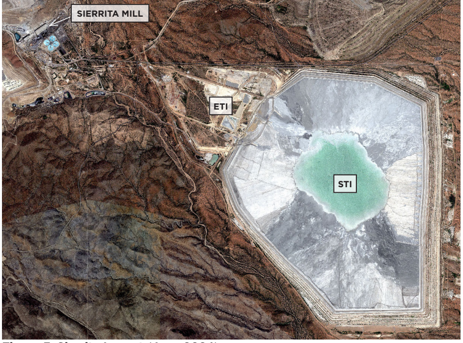
Figure 3. Sierrita Layout (June 2024).